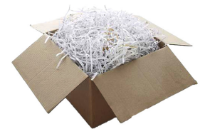
Shredded Paper (place in box or paper sack)