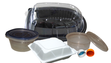
Plastic and Styrofoam Food Containers, Lids and Loose Caps