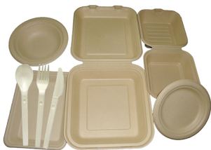
Compostable Plates, Containers, Cups, Utensils and Bags