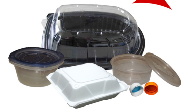
Plastic and Styrofoam Food Containers, Lids and Loose Caps