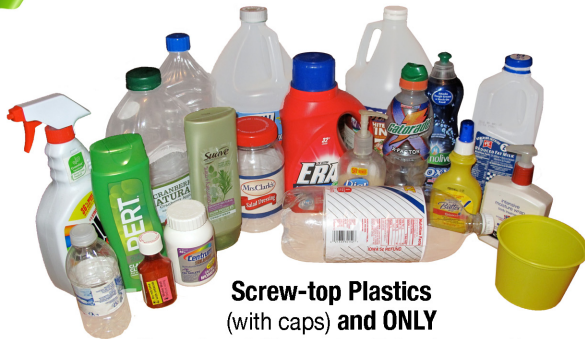
Screw-top Plastics (with caps) and ONLY Yogurt and Margarine Tubs (NO LIDS)