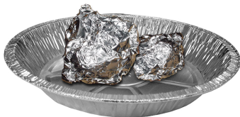
Baking Tins and Aluminum Foil

NO Food & Liquids Compost instead! Or throw in the trash.