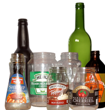
Glass Jars & Bottles