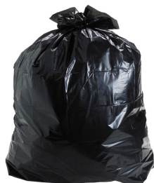
Garbage or Yard Debris