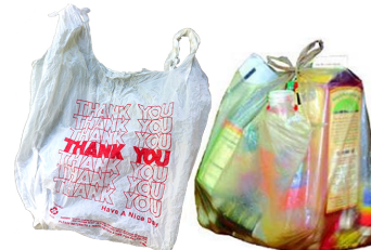
Plastic Bags or Recyclables in Plastic Bags