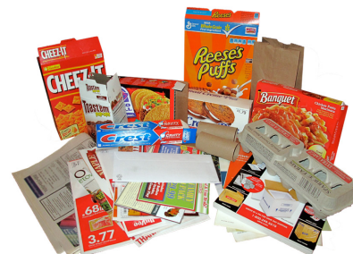
Newspaper, Glossy Inserts and Magazines, Mixed Paper (junk mail, phone books, envelopes) Cardboard (break down flat to fit inside or beside cart)