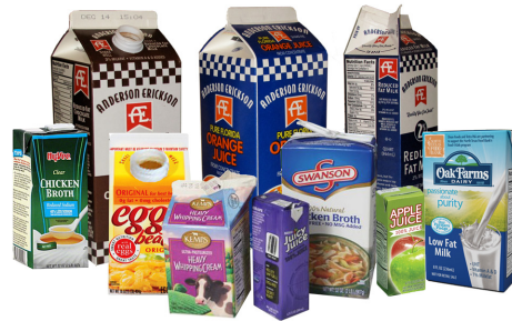
Paper Food Cartons (no caps) (not cylinder shaped)