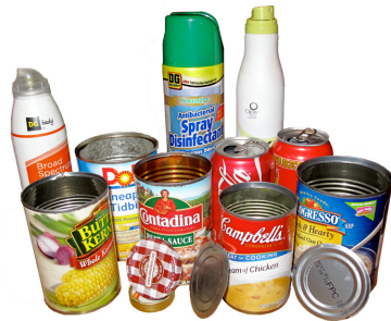
Aluminum, Tin and Empty Aerosol Cans