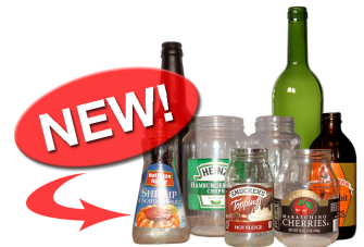
Glass Jars & Bottles