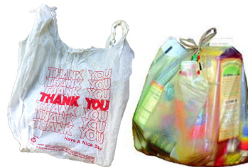
Plastic Bags or Recyclables in Plastic Bags