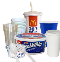
Plastic and Paper Cups, Tubs, Lids and Utensils