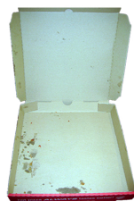
Food Contaminated Items (pizza boxes, paper plates, napkins, etc.)