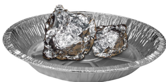
Baking Tins and Aluminum Foil